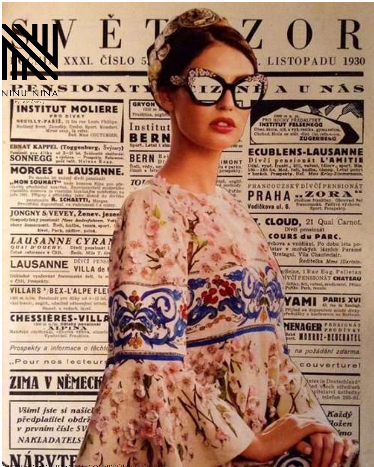
( https://www.instagram.com/p/BQLCYFUDBU/ )